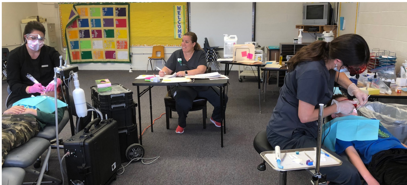
Tooth BUDDS sends affiliated practice dental hygienists to dental deserts to provide screenings and treatment to nearly 550 children a year.