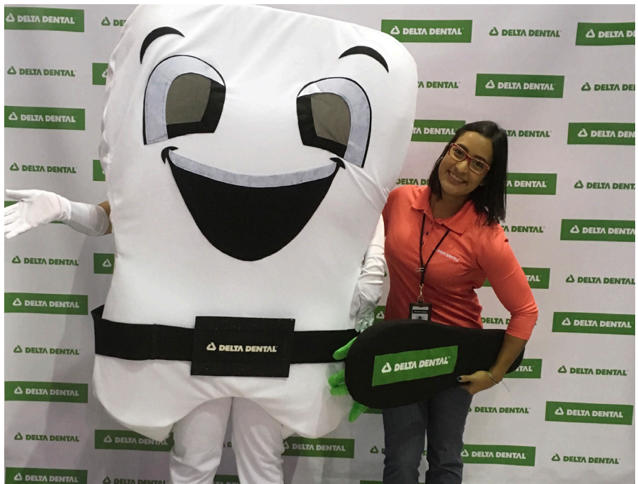
In 2019, more than 24,600 students and teachers in 123 public schools across Puerto Rico participated in Nestlé's Global Healthy Children's Day.