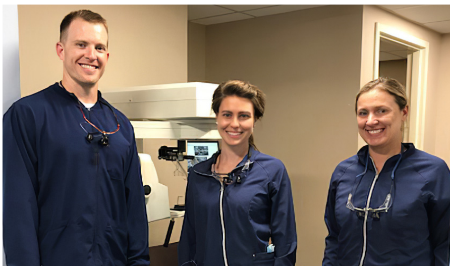
In 2019, three externs helped serve their patient base, including 2,400 new patients.

MouthScience™ is Delta Dental of Oklahoma's experiment-based clinic that provides third through sixth graders with a hands-on opportunity to learn about the importance of good oral hygiene and the effect personal choices have on their oral health. During the 2018-19 academic year, more than 3,500 students from 25 different public schools across the state used their math and science skills to observe, chart, and hypothesize the positive outcomes from making smart oral health choices.