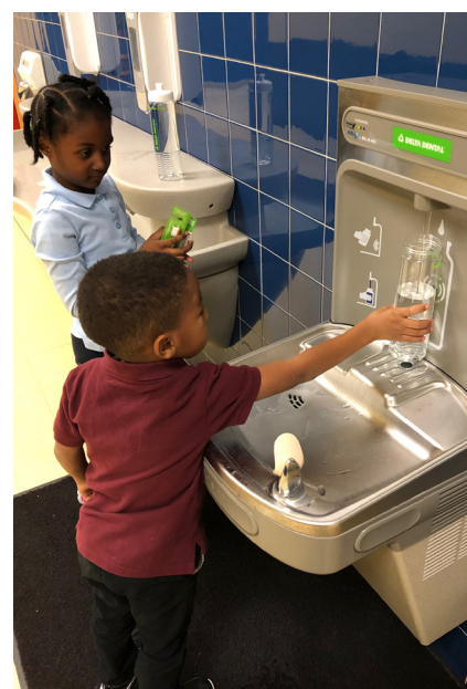
Students refilling their water bottles at a Rethink Your Drink water-filling station

addition of a water filling station in 143 schools across the state through Rethink Your Drink encourages healthy choices for 77,100 students and staff members while saving 1.4 million plastic water bottles from going to landfills.