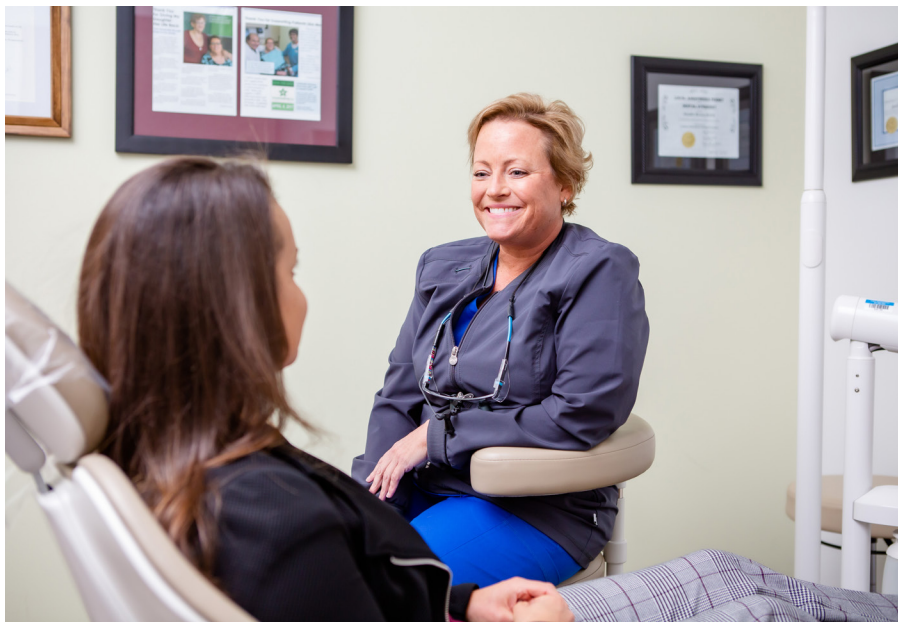
The CARTI Foundation, a nonprofit cancer center, provides oral care rescue bags to patients undergoing head and neck radiation.