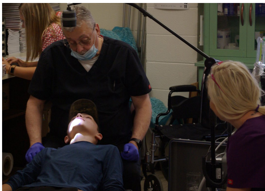
With the support of Delta Dental of Kentucky, the Red Bird Mission Clinic was able to work with nearly 600 patients to improve their quality of life through better oral health.

The Happy Smiles School-Based Dental Clinic was able to open its doors for the first time in 2019. The clinic is run by the Doña Ana Community College and primarily funded by Delta Dental of New Mexico, enabling students living in high-poverty areas to receive free preventive dental services, such as cleanings, sealants, and fluoride treatments. Last year, 190 patients in the Las Cruces, New Mexico region were able to receive treatment.