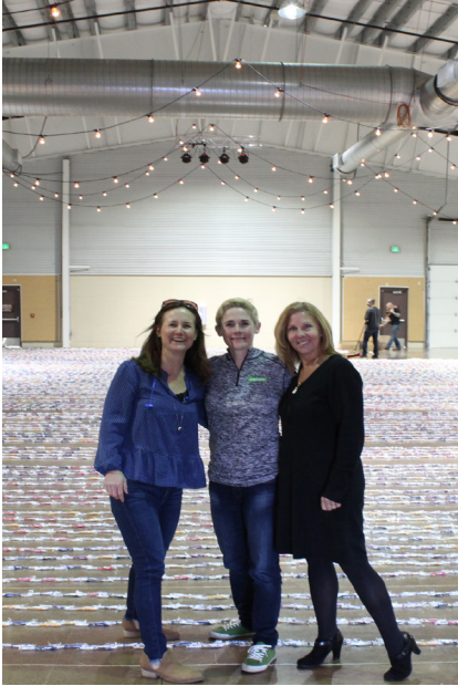
Raising awareness for National Children's Dental Health Month by breaking the Guinness World Record for longest line of toothbrushes.