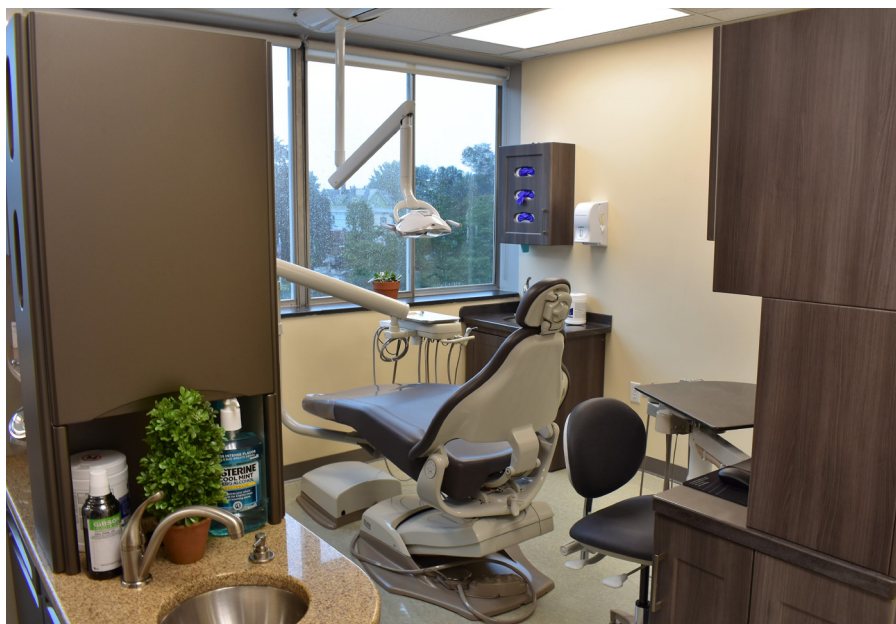
With Delta Dental of Rhode Island's support, the Rhode Island Free Clinic expanded services to include comprehensive oral health care.