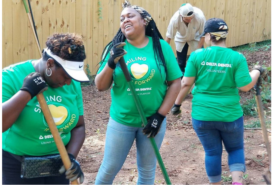
By the end of this Smiling it Forward Fall challenge, employees from across the country logged 5,180 hours helping support the community through activities like park cleanups.

Change Gangs: Virtual Giving Circles brings individuals together to support worthy causes, such as raising awareness for National Children's Dental Health Month by breaking the Guinness World Record for longest line of toothbrushes. Over 60 volunteers joined Delta Dental of Colorado Foundation to create a 3.5-mile chain of 41,769 toothbrushes, bringing attention to the 56% of Colorado children six and younger who have not visited a dentist in the last year. The toothbrushes, along with 16,000 tubes of toothpaste, were then donated to 28 community organizations throughout Colorado.